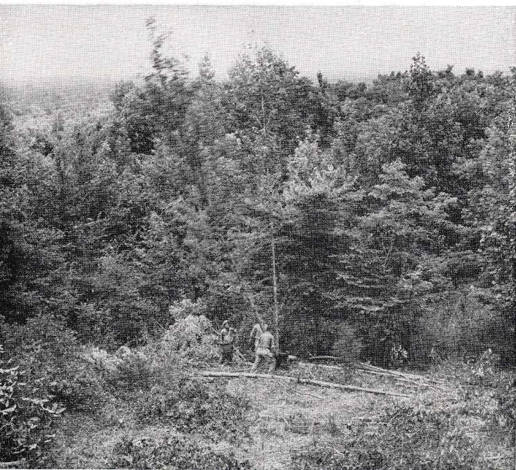
Harvesting forest land is a good way to add to your income. Here the GRAVELY Tractor with its Rotary Saw Attachment is felling slash pine for pulpwood. Notice the size of the tree being felled, and that the Saw goes to the job!

You bring new land into productive pasture or crop land easily, quickly and economically with the new GRAVELY Rotary Saw Attachment! One man, with this power-driven Saw clears land of brush and filth, cuts sprouts, weeds, saplings or trees, anything up to 18 inches through, in an amazingly short time compared to hand methods.