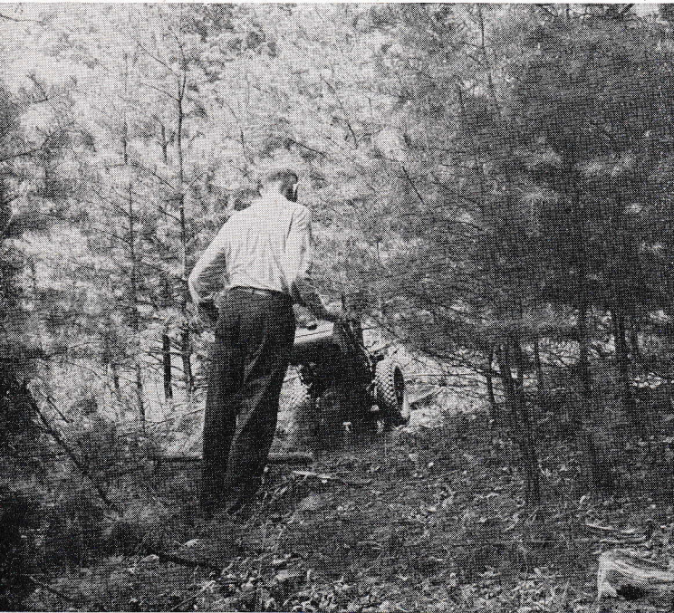
Clearing land is quick and inexpensive with the GRAVELY Rotary Saw Attachment. Merely put the Saw in the horizontal position, put the tractor and attachment in gear and guide the machine—POWER does the work.